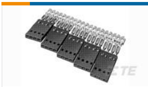
TE Part # 103648-2 03 MTE RCPT HSG SR RIB .100CL