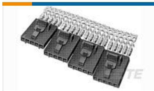
TE Part # 103958-2 8X3 MTE RCPT SR LATCH .100CL