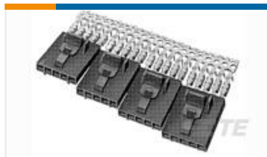
TE Part # 103961-2 8X3 MTE RCPT SR LATCH .100CL