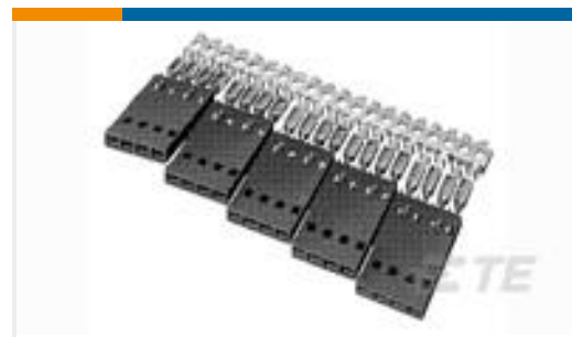
TE Part # 103970-2 8X3 MTE RCPT SR RIBBED .100CL